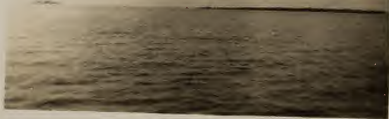
Low Isles 16. vii 28 First view